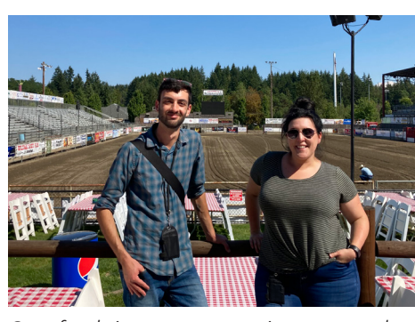
Our food inspectors monitor more than 1,300 permanent food establishments as well as temporary vendors at festivals and other community events.