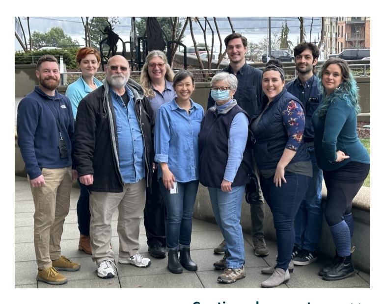
Continued on next page >>