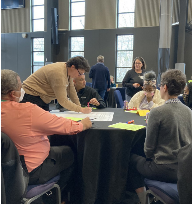
A meeting of the Kitsap Health Equity Collaborative. The collaborative launched in 2022 as a way for community organizations to collectively address systemic inequities that effect the health of people in Kitsap County.